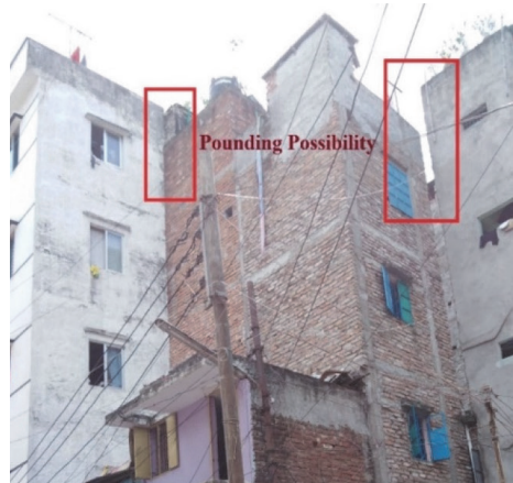
Figure 5. Pounding between Adjacent Building