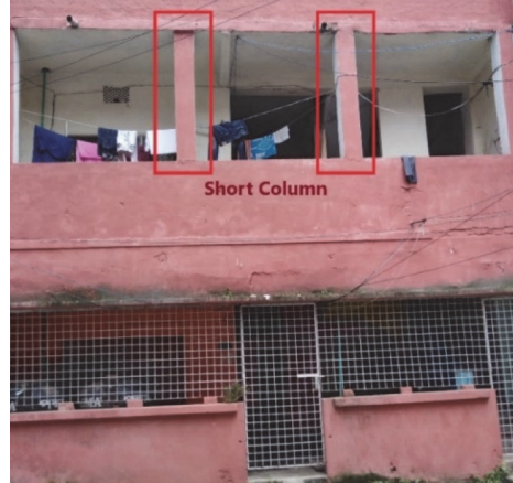
Figure 3. Presence of Short Column