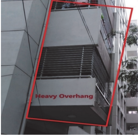
Figure 2. Presence of Heavy Overhang