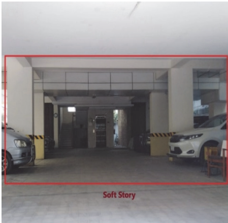
Figure 4. Presence of Soft Story