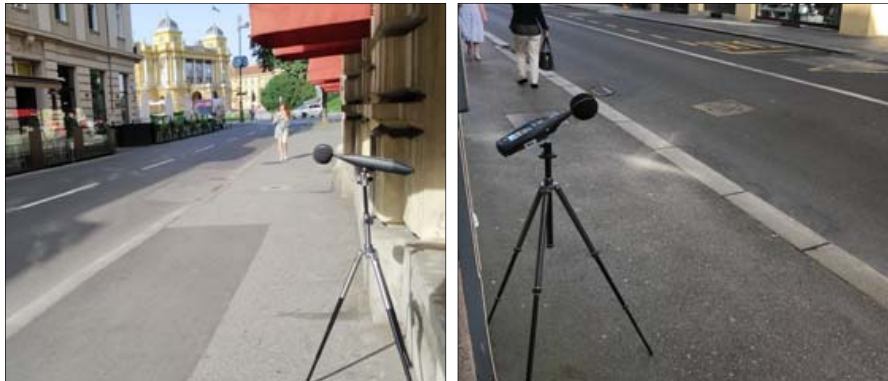
Figure 3. Noise measurements in Masarykova St.: MP1 (left), MP2 (right)

the height of 1.2 m above the ground (Figure 3). Measuring point MP1 was located in the central part of the Section 1 and measuring point MP2 in the central part of the Section 2 of Masarykova St. (Figure 1). Measurements were carried out under favourable meteorological conditions. Air temperature ranged from 18 °C to 21 °C, wind speed from 2 m/s to 3 m/s, humidity from 55 % to 60 %, while the air pressure was around 1012 hPA. As shown in Table 2, noise levels were higher than permitted at both measuring points in all periods.