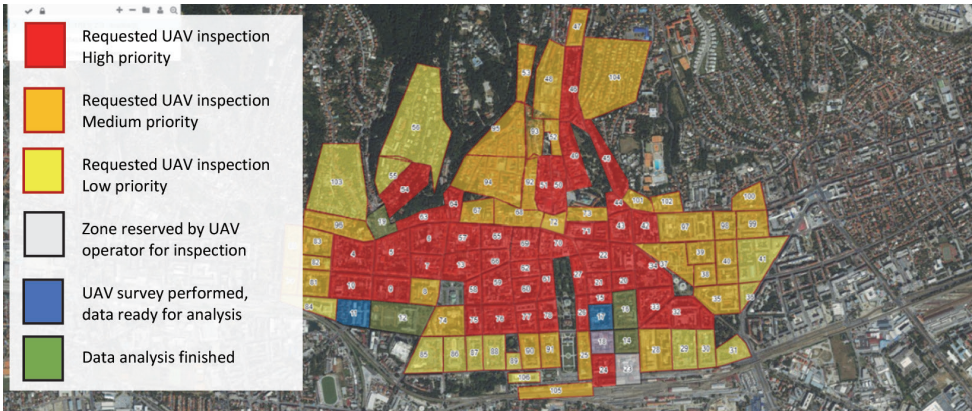
Figure 2. Zone definition and classification for UAV inspection

assessment). All UAV operators have been issued detailed instructions on how to perform flight missions (including height, camera angle, photo settings, flight path etc.) in order to collect the data in an optimal way for further analysis, Figure 3. Both orthogonal imagery and images at a 30 degree angle of the same area have been recorded. Namely, orthogonal imagery is important for creating current geo-referenced orthophoto of the zone. In contrast, angled imagery is crucial for civil engineering professionals' visual assessment since most of the damage is not visible from orthogonal projection (damage on vertical walls, chimneys, etc).