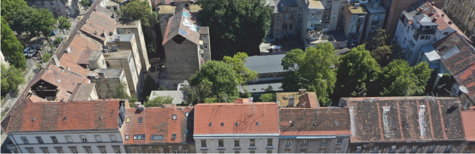
Figure 4. Typical UAV photography that was later on analysed