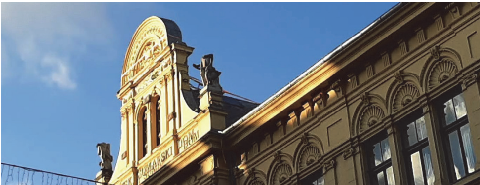
Figure 1. Detail of one of the buildings in Zagreb with beautiful decorations, beheaded

Having a history connected with Austria and Hungary, many of our former engineers and architects came from those countries or studied there, where the earthquakes do not significantly influence the building safety. Therefore, many of the Downtown buildings in Zagreb and Petrinja were built without considering the earthquakes and with more or less rich decorations, and contrary to the suggestions of the great Andrija Mohorovičić, who already after the 1880 Zagreb event warned of the dangers from the falling sculptures etc. [3] as seen in Figure 1 after the 2020 event.