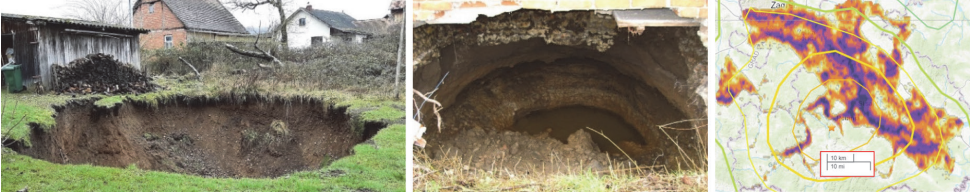
Figure 6. Two of the cover-collapse sinkholes in Mečenčani. Widespread liquefaction in the December earthquake [8]

In a similar way, architects should be aware of the requirements that actual ground conditions, as well as landslides etc. could pose to the foundations.