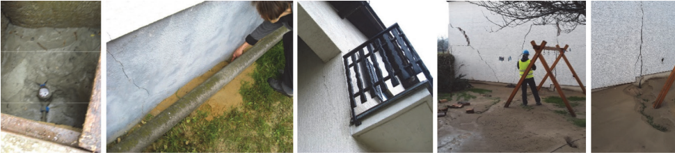
Figure 7. Three photos from Petrinja: a manhole filled with sand due to liquefaction, ejecta on the other side of the house and the consequent cracking; cracks around the balcony due to settlement caused by liquefaction across the street. Two photos from Brest Pokupski: a cracked house and thick layer of ejecta after liquefaction – the crack spread through several yards and filled several houses with up to 50 cm of sand

In a similar way, architects should be aware of the requirements that actual ground conditions, as well as landslides etc. could pose to the foundations.