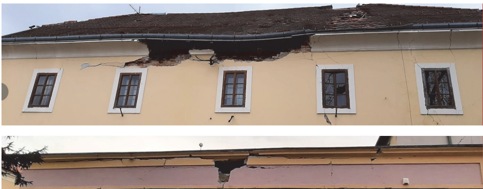
Figure 2. Unfortunate houses in Petrinja illustrate the need to hem the walls – which was done only visually, not structurally

Almost each big earthquake gives new insights and allows the design rules to be improved. However, the importance of the structural simplicity has been recognized a long time ago, together with the importance of regular stiffness distribution, uniformity, symmetry and redundancy, regularity in elevation and in plan, minimizing weights, etc. The behaviour of buildings may be regulated by pendulums, dampers, isolators, etc. [4]. Less fortunate buildings – with irregular plans and without proper reinforced concrete elements – suffered serious damages or collapsed. Two examples shown in Figure 2 witness our need to close the walls and to highlight the edges – but it was done only as a decoration, not structurally.