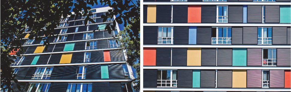
Figure 3. Building designed by architect Ivan Vitić in Zagreb, Laginjina 9 [5]