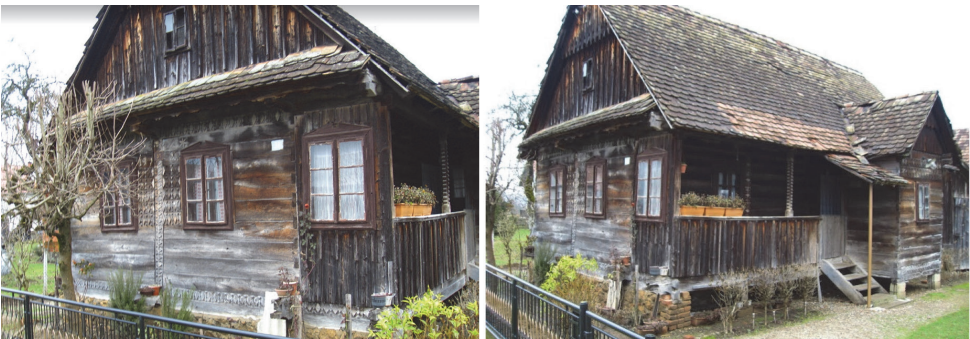
Figure 5. Wooden house in Mečenčani, on the fault of the December earthquake, without any damage. Wooden houses in the area suffered occasional plaster peeling, but generally no structural damages

Urbanists are too often not interested in the ground conditions. However, the widespread liquefaction in the Sisak-Moslavina County, and numerous sinkholes that suddenly opened in and around Mečenčani, show that the urbanists should get involved with geotechnical engineers, who are to work with geologists and geophysicists before deciding on the future plans for new settlements.