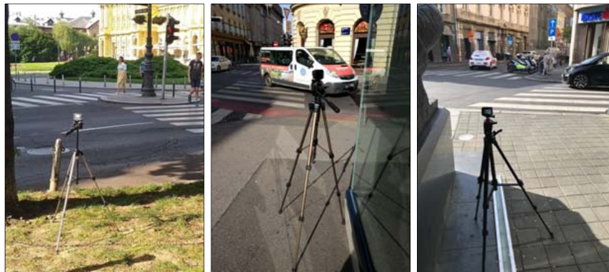
Figure 2. Traffic volume measurements at road intersections in Masarykova St.: C1 (left), C2 (middle), C3 (right)

Short term traffic volume measurements were carried out by means of three video cameras (C1, C2, C3) placed at aforementioned road intersections in Masarykova St. (Figure 1, Figure 2). Measurements were conducted in day period from 8:00 a.m. to 9:00 a.m., evening period from 8:00 p.m. to 9:00 p.m., and night period from 11:00 p.m. to 12:00 p.m. Recorded vehicles were divided in two main groups: personal cars and delivery vehicles. As shown in Table 1, approx. 62% of the total traffic entering the Masarykova St. continues its course straight towards Preradovićeve St., while 36% of the traffic turns left and 2% right to Gundulićeve St.