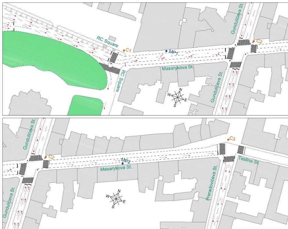
Figure 1. Masarykova Street in the city of Zagreb: Section 1 (up) and Section 2 (down)

In the vicinity of the observed area there are mainly business, but also residential buildings, up to 18 m high. According to Croatian Rulebook on maximum permissible noise levels in areas where people work and live [8] and Master Plan of the city of Zagreb [9], noise levels in such areas should not exceed 65 dB(A) in day and evening periods, and 50 dB(A) in night period. Durations of these periods are prescribed by Croatian Law on noise protection [10] and they last as follows: day period from 7:00 a.m. to 7:00 p.m., evening period from 7:00 p.m. to 11:00 p.m., and night period from 11:00 p.m. to 7:00 a.m.