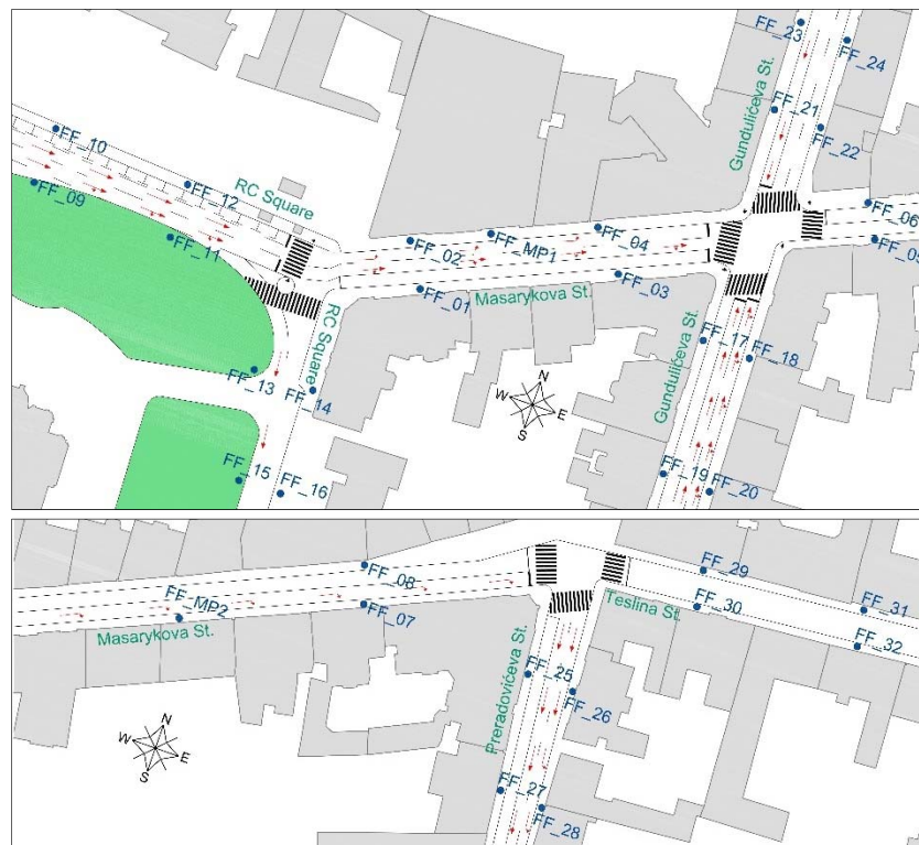
Figure 4. Locations of free field receptors

As it can be seen from Table 4, these average noise levels were higher than permitted in all analysed streets and periods, except in Teslina St. in day and evening periods. Consequently, a comparison between the average noise levels for current noise situation (S1) and the average noise levels for other noise mitigation scenarios (S2, S3, S4, S5, S6) was made (Figure 5).