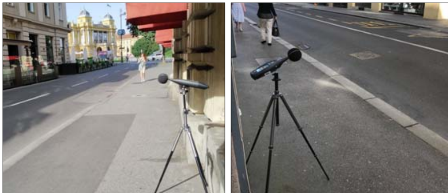
Figure 3. Noise measurements in Masarykova St.: MP1 (left), MP2 (right)

the height of 1.2 m above the ground (Figure 3). Measuring point MP1 was located in the central part of the Section 1 and measuring point MP2 in the central part of the Section 2 of Masarykova St. (Figure 1). Measurements were carried out under favourable meteorological conditions. Air temperature ranged from 18 °C to 21 °C, wind speed from 2 m/s to 3 m/s, humidity from 55 % to 60 %, while the air pressure was around 1012 hPA. As shown in Table 2, noise levels were higher than permitted at both measuring points in all periods.